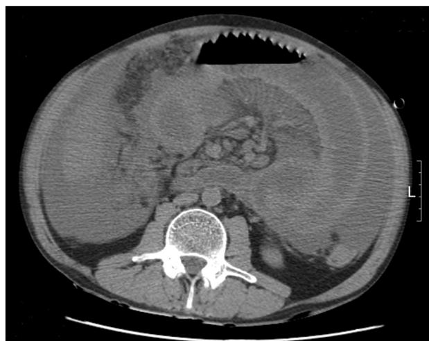
Fig. 1. Noncontrast abdominal computed tomography image showing ascites, hepatomegaly and diffuse wall thickening of the small bowels.

Before empirical antibiotic therapy, two sets of blood samples were collected and cultured in a BacT/Alert 3D system (bioMérieux, Marcy l'Etoile, France). An AF sample collected from paracentesis was inoculated onto both a blood agar plate (BAP) and a MacConkey agar plate (MAC) and incubated for 24 hr at 35°C in a 5% CO 2 atmosphere. White and mucous colonies were observed on BAP and MAC in the AF culture and the isolate was identified as P. rettgeri by the Vitek 2 system (bioMérieux). All blood culture bottles were "positive," and Gram staining revealed polymicrobial growth of gram-positive and gram-negative rods (Fig. 2A, B). The broth of positive blood cultures was inoculated onto BAPs and MACs and incubated for 24 hr at 35°C in a 5% CO 2 atmosphere, but only gram-negative rods with white and mucoid colonies were observed (Fig 2C, D). Suspecting a polymicrobial bacteremia with obligate anaerobe, the broth from the anaerobic bottle was subcultured onto a Brucella agar plate and cultured anaerobically.